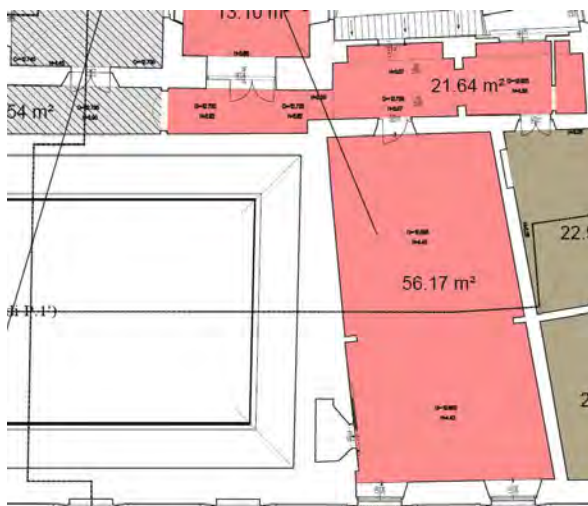
SALA della TORRE – 2° piano – PALAZZO VAJ – Via Pugliesi 26 – 59100 PRATO